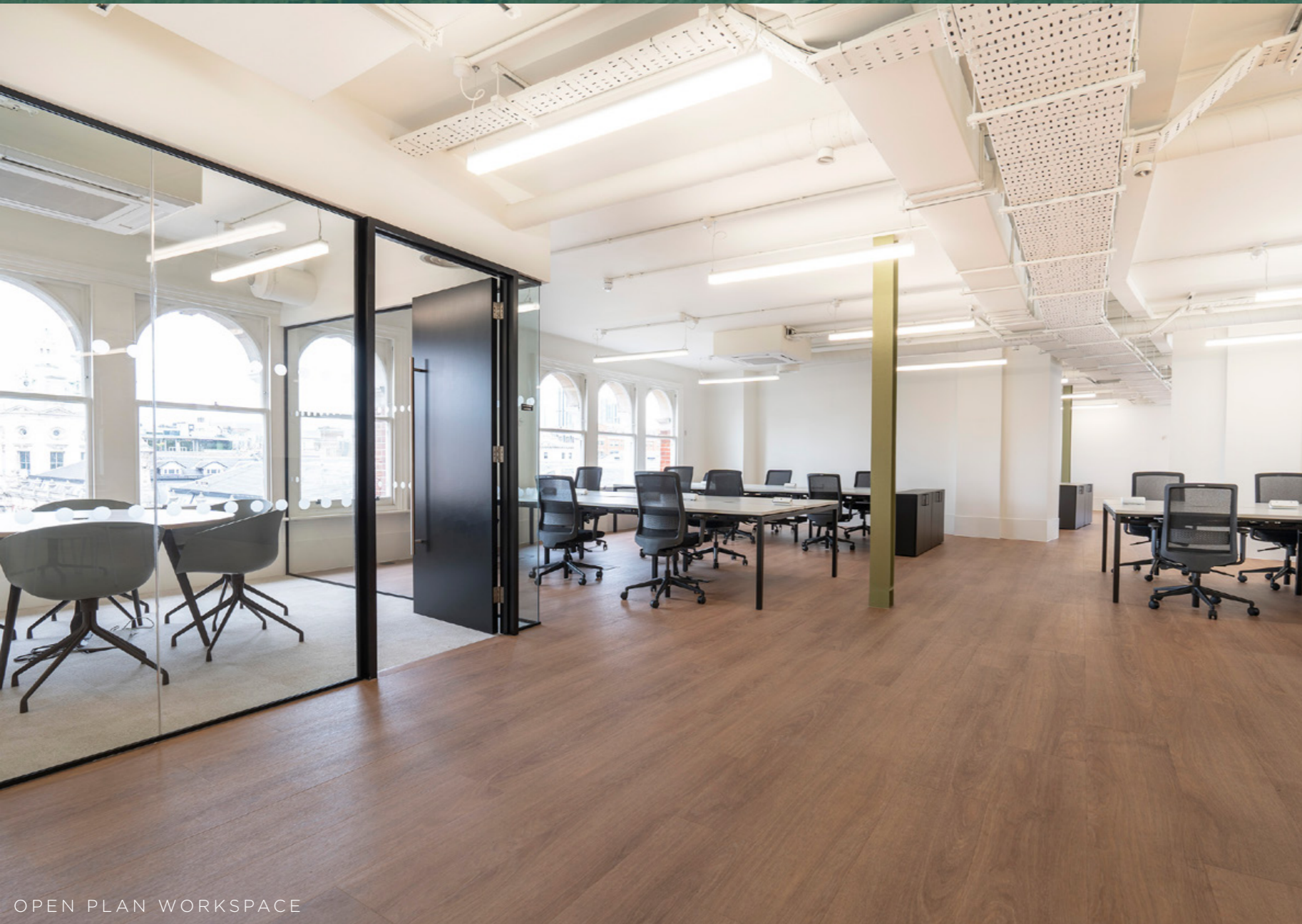
OPEN PLAN WORKSPACE