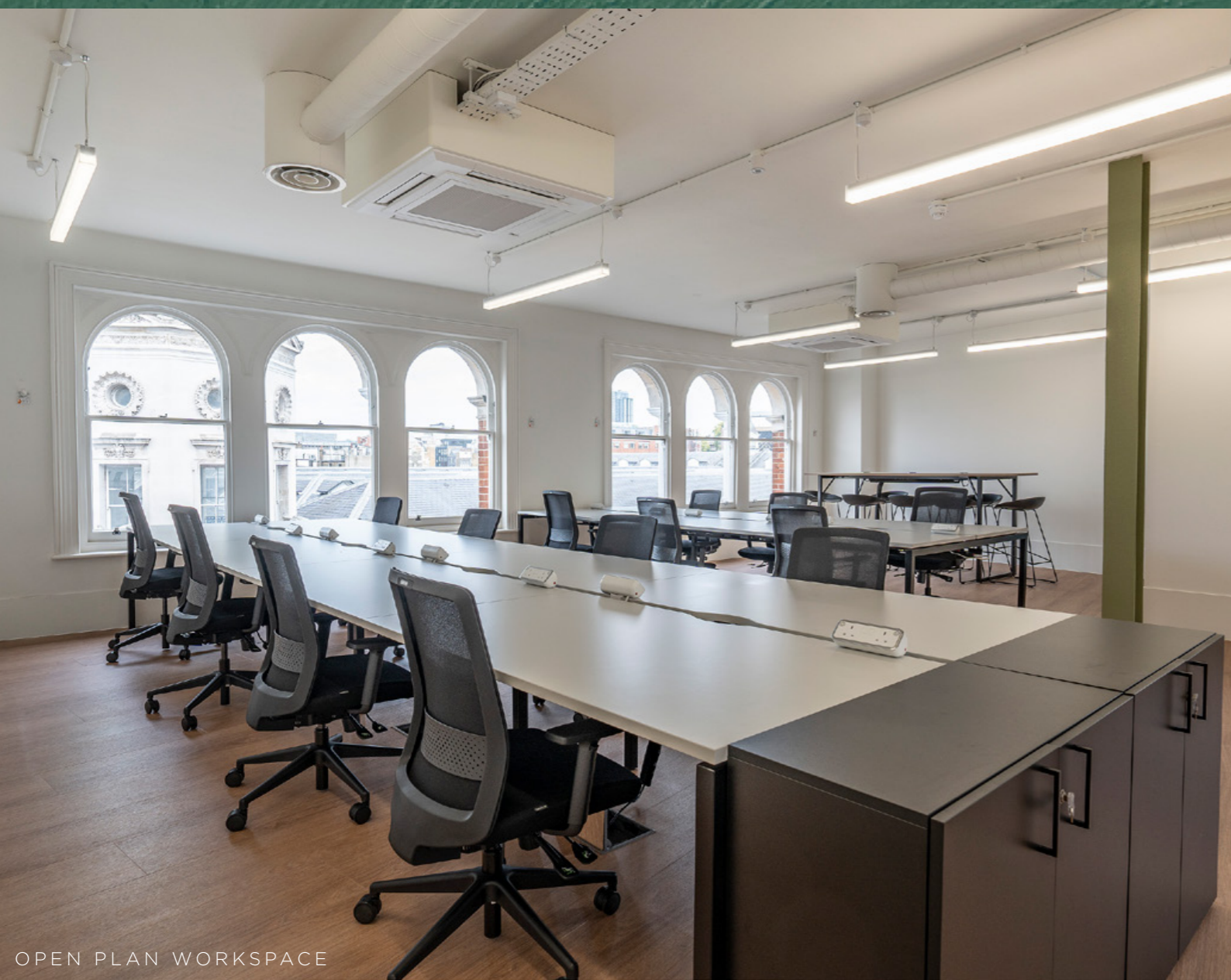
OPEN PLAN WORKSPACE