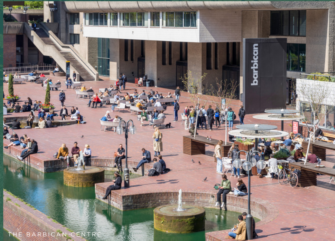
THE BARBICAN CENTRE