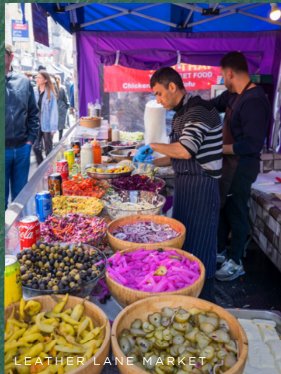
LEATHER LANE MARKET